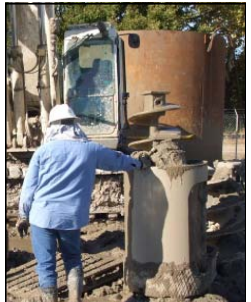
View of one of the downshafts for the Kansas River tunnel.

The Main Connection is published for our Phase V community partners in Wyandotte County. Email questions about the Main Connection to ekoutelas@waterone.org or call (913) 895-5540.