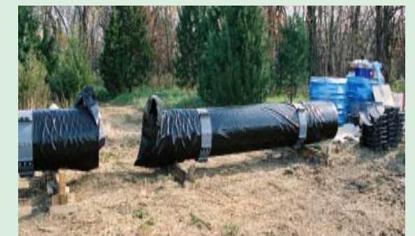
30" transmission main along K-7