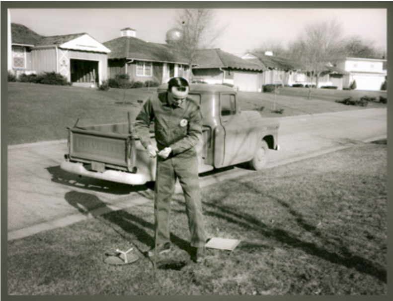
Water for the suburbs: An employee accesses a meter pit in Prairie Village circa 1950s.

Additional information is available at www.waterone.org/Lead .