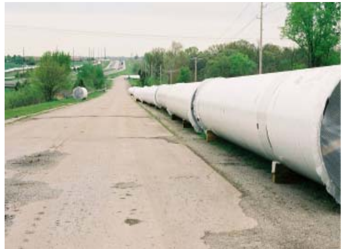
Photo showing sections of 60-inch pipe that have been staged along the pipeline route, ready for installation.