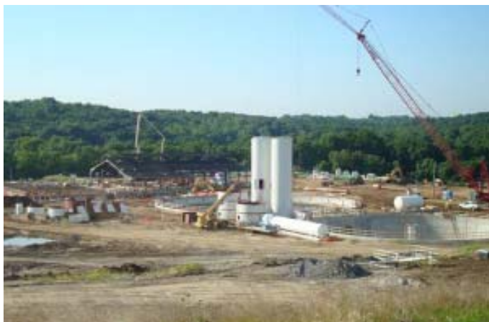
Completion of Phase V pipeline and new treatment plant scheduled for 2009.