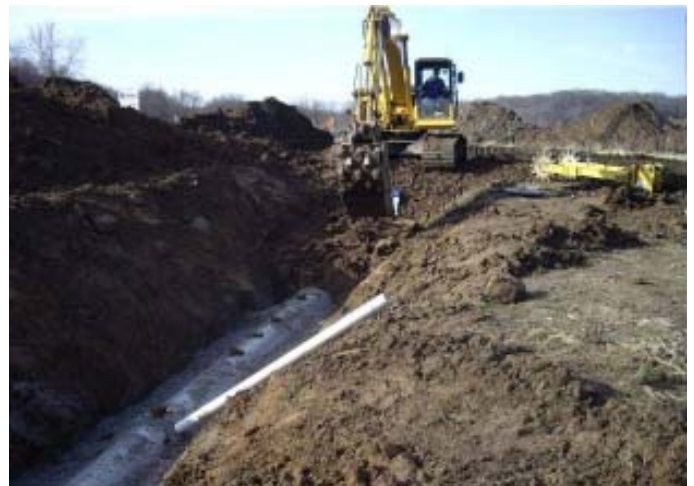
Photo showing pipe as it looks when installed.

The Main Connection is published for our Phase V community partners in Wyandotte County. Email questions about the Main Connection to ekoutelas@waterone.org or call (913) 895-5540.