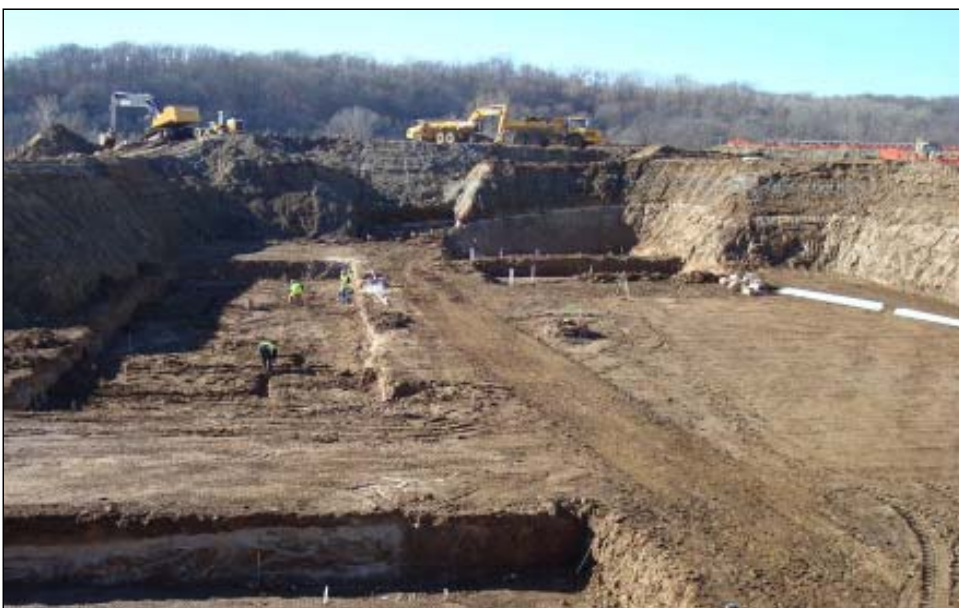
Excavated area where Operations Building will be located.