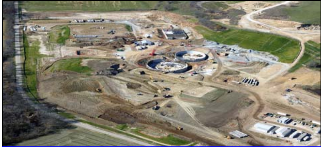
Aerial view of new Treatment Plant complex.

"Each day of construction brings the expansion of WaterOne's treatment facilities in Wyandotte County closer to completion. Through the Main Connection , we are keeping you informed about progress on this project."