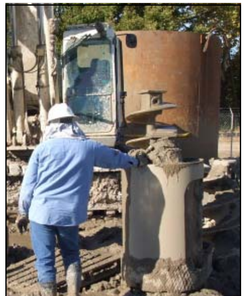
View of one of the downshafts for the Kansas River tunnel.

The Main Connection is published for our Phase V community partners in Wyandotte County. Email questions about the Main Connection to ekoutelas@waterone.org or call (913) 895-5540.