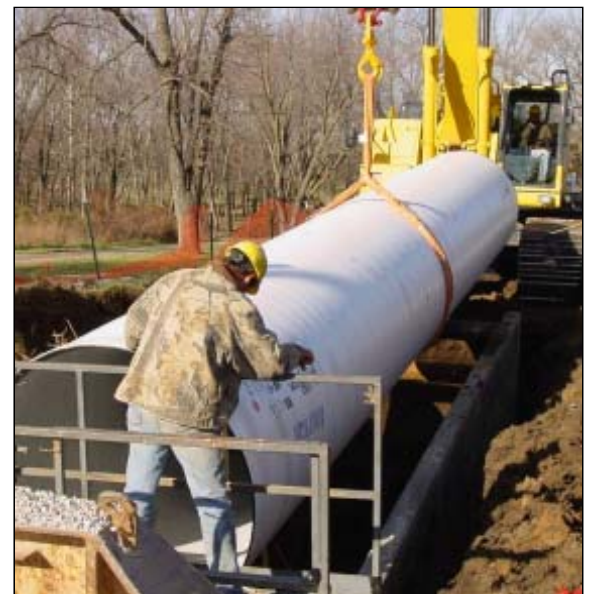
Photo showing installation of new water main.